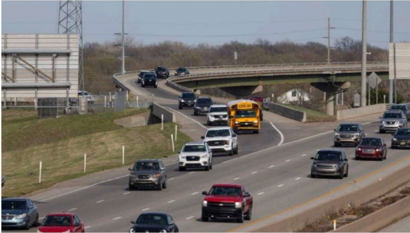
The interchange from I-135 on to westbound Kellogg.

BY JOSEPH HERNANDEZ MAY 23, 2024 5:30 AM